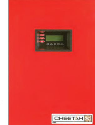
Cheetah Xi 50

design the ideal system for your facility. The 1016 system comes standard with two Signaling Line Circuits (expandable to four loops) that support 254 devices each. And you can network up to 128 Cheetah Xi's and/or the Fike CyberCat fire alarm panels, for up to any combination of 130,048 sensors and modules!